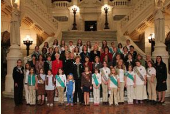
Pictured above are all the official members of Troop Pennsylvania, an Honorary Girl Scout Troop comprised of women in the PA state legislature to help generate excitement about the upcoming 100th Anniversary of Girl Scouting.

26 women from the Pennsylvania state legislature gathered at the State Capitol in Harrisburg on Tuesday, October 18, to help Pennsylvania's three Girl Scout councils generate excitement about the 100th Anniversary of Girl Scouting by becoming honorary members of Troop Pennsylvania.