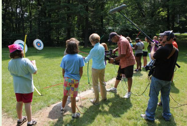
Pictured above is Judy Woodruff and the WITF crew during filming at Camp Furnace Hills

GSHPA is thrilled to announce to our volunteers that the production of our special presentation for the 100 th Anniversary of Girl Scouting has wrapped up and air dates for the program have been set. Girl Scouts: Shaping a Century —an hour-long PBS special focused exclusively on Girl Scouts in the Heart of Pennsylvania will air on PBS stations across the state on the dates and times listed below: